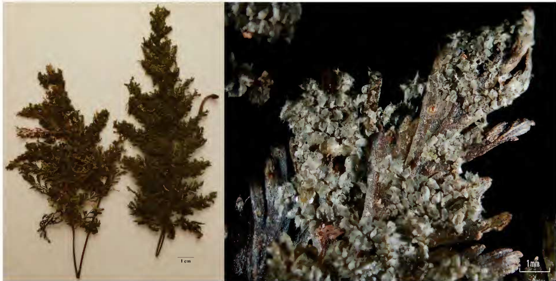
Fig. 1. Habit of Jubula hutchinsiae (Hook.) Dumort. subsp. javanica (Steph.) Verd; whole plants on left, close-up of shoot on right.

\times 15\text{--}22\ \mu\text{m} , basal cells 28\text{--}56 \times 20\text{--}30\ \mu\text{m} , cell walls thin, trigones minute; oil bodies unknown; leaf lobule galeate, 193\text{--}240 \times 166\text{--}180\ \mu\text{m} ; stylus filiform, 4–6 cells long. Underleaves contiguous, suborbicular, 0.3\text{--}0.4 \times 0.3\text{--}0.4\ \text{mm} , bilobed to 1/2 \times their length, lobe apices acuminate, sinus narrowly to widely acute, margins entire. Gemmae not seen. Paroicous . Androecia intercalary on lateral branches, bracts and bracteoles in 3–9 pairs. Gynoecia terminal with one innovation; lobe lanceolate, 0.9\text{--}1 \times 0.2\text{--}0.3\ \text{mm} , apex acuminate, upper margin with 4–7 triangular teeth; lobules lanceolate, 2/3\text{--}1/2 \times lobe length, apex obtuse to acuminate, margin entire; bracteoles ovate, 1.1\text{--}1.2 \times 0.3\text{--}0.4\ \text{mm} , bilobed to 2/3 \times their length, lobe apices acuminate, sinus narrow, margins in upper 1/3 dentate, central region gibbous. Perianth exerted by 2/3\text{--}1/2 total length, oblong, 1.4\text{--}1.7 \times 0.6\text{--}0.8\ \text{mm} , 3-keeled, margin entire; beak 80\text{--}86\ \mu\text{m} , 5–6 cells long. Sporophyte not seen. Fig. 1.